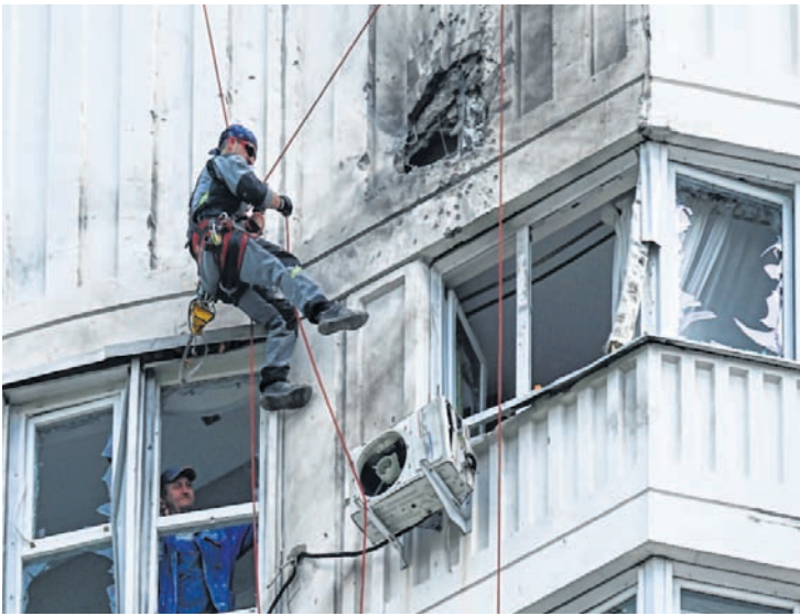
A specialist inspects the damaged facade of a multi-storey apartment after reported drone attack in Moscow on Tuesday

The attacks have raised questions about the effectiveness of Russia's air defence systems.