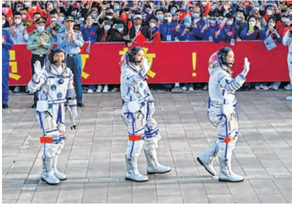
Chinese astronauts wave before boarding a Long March-2F carrier rocket at the Jiuquan Satellite Launch Centre on Tuesday

China on Tuesday successfully sent three astronauts including its first civilian into orbit as it launched the Shenzhou-16 manned mission to its space station for second crew rotation, signalling another leap forward for the country's ambitious space programme.