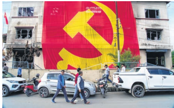
Locals arrive to mark the 10th Constitution Day in Kathmandu, Nepal, on Friday

Karki was speaking at the main event organised here in view of the Constitution Day, also celebrated as the National Day across Nepal. However, unlike in the past, the celebrations this year are scaled down as the country mourns the death of 72 people in the violent protests by Gen Z that led to