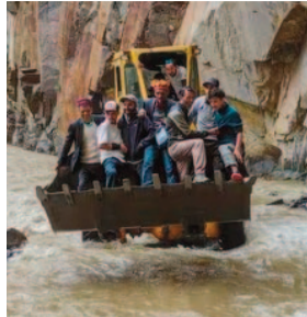
An excavator being used to assist people to cross a stream in Lahaul and Spiti district of Himachal

The Army on Tuesday launched an extensive humanitarian assistance and disaster relief operation in flood-affected areas of Jammu and adjoining areas of Punjab, deploying multiple rescue columns and helicopters to evacuate stranded civilians and BSF personnel.